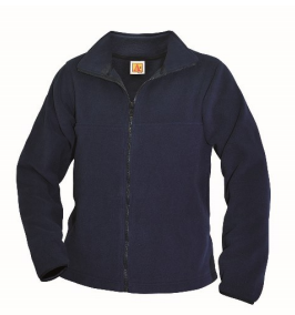
Polar Fleece Jacket w/ Logo