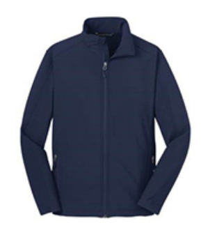
Soft Shell Jacket w/ Logo