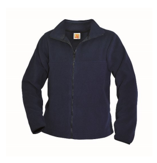
Polar Fleece Jacket w/ Logo