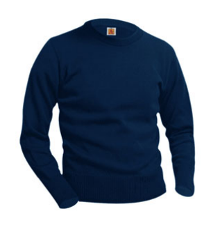
Crew Neck Pullover Sweater w/ Logo