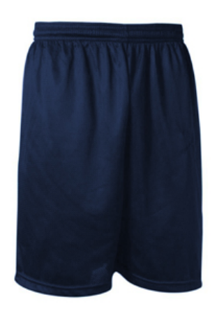
Navy Micromesh Nylon Gym Shorts