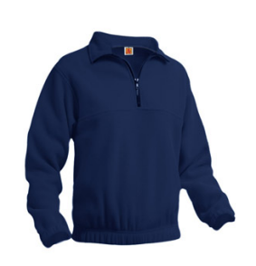
1/4 Zip Polar Fleece Jacket w/ Logo