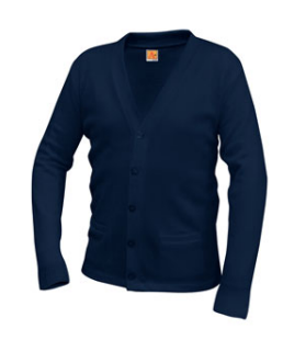
V-Neck Cardigan Sweater w/ Logo