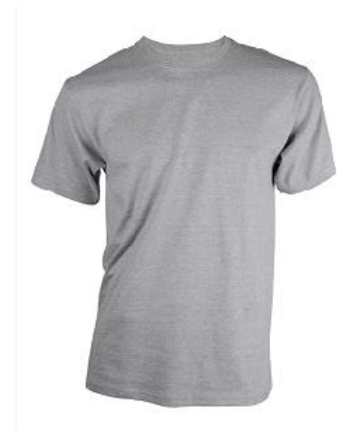
Light Steel Gym Tee Shirt