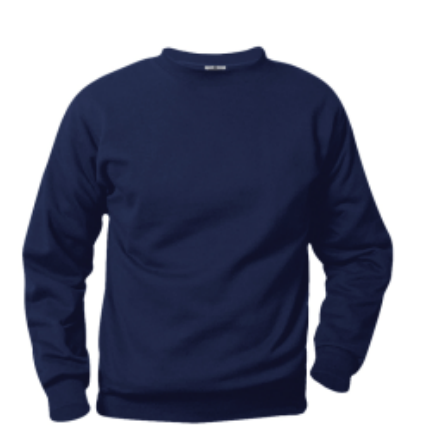
Navy Heavyweight Sweatshirt (Optional)