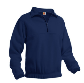
1/4 Zip Polar Fleece Jacket w/ Logo