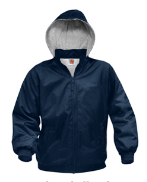
Nylon Shell Jacket w/ Hood & Logo