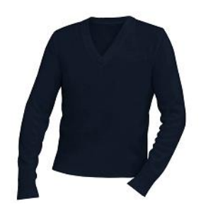
V-Neck Pullover Sweater w/ Logo