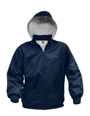
Nylon Shell Jacket w/ Hood & Logo